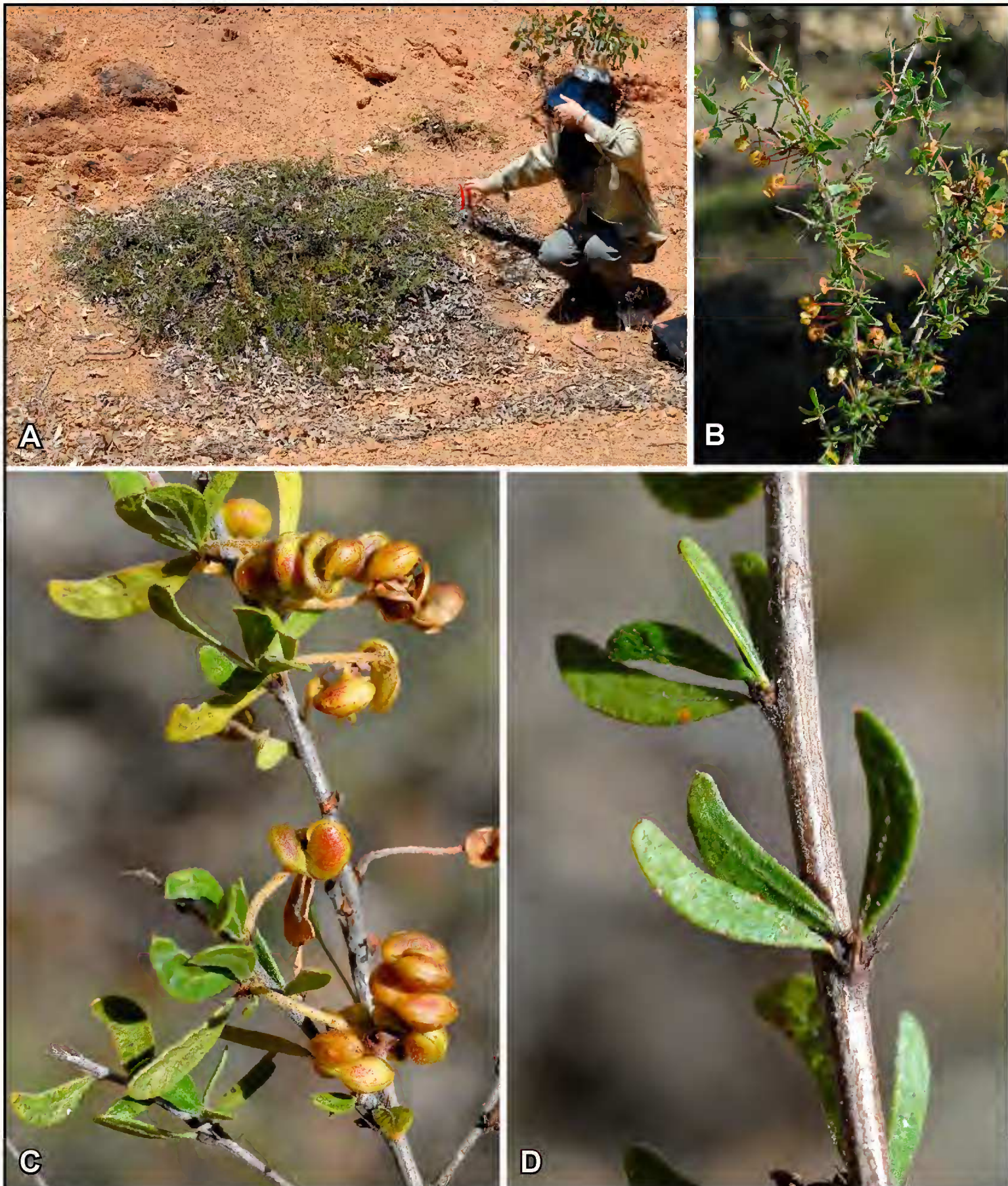
Figure 4. Acacia parkerae . A – prostrate growth form (with Thu Maslin), B – fruiting branch, C – distinctively tightly coiled pods; D – nodes showing fasciculate phyllodes. Photographs by Bruce Maslin.

oblong-oblongate or obovate, (8–)10–25 mm long, (2–)3–5(–6) mm wide, l:w = 3–5(–6), normally shallowly incurved, 1-nerved, innocuous. Inflorescences simple, peduncles (7–)10–30(–40) mm long, slender, rarely bracteate; heads globular, 22–25-flowered. Bracteoles 1.5–2 mm long, often slightly exerted in mature buds, the laminae triangular-lanceolate and acuminate. Flowers 5-merous; sepals ±free. Pods tightly and sometimes irregularly spirally coiled, 3–4(–5) mm wide, ±nerveless. Seeds not mottled or sometimes very obscurely mottled.